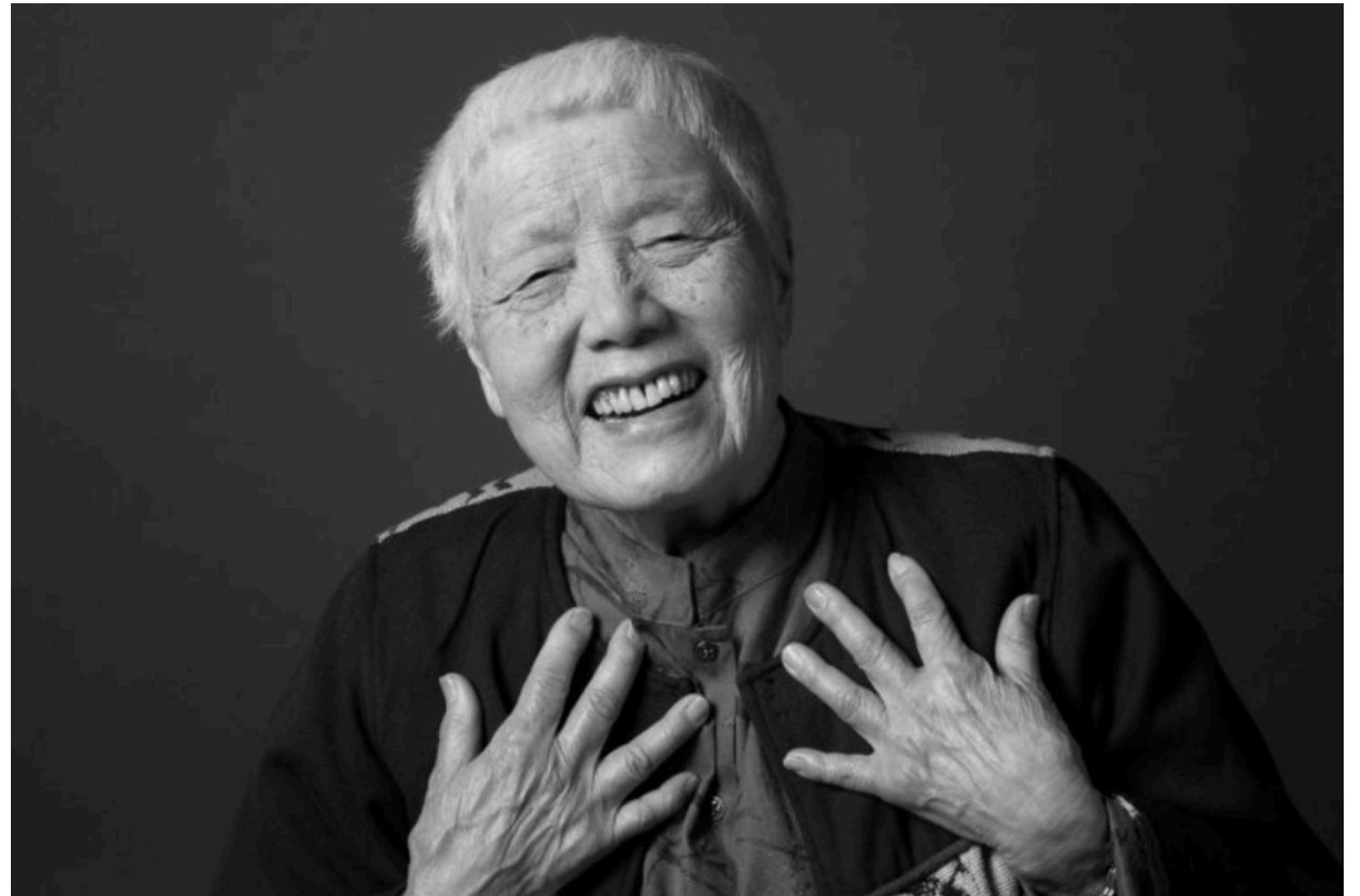
Grace Lee Boggs